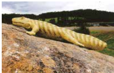
Genoa River Tetrapod model near the tennis courts Genoa Campground

Time and the forces of nature worked on this piece of crust until it broke up forming the landmass of Australia, which is thought to have continued to drift due to convection currents in the Earth's mantle (Continental drift hypothesis). The plateau of the Monaro tablelands forms part of the Genoa River catchment. Small sections of the plateau form Mt Nungatta. Tilted blocks form Yambulla Peak and Mt Wakefield with their small escarpments. Down river, the Genoa Gorge reveals a sequence of sediments from Merimbula red siltstone beds shed by the Eden volcanics to late none-marine Devonian sediments with fossils.