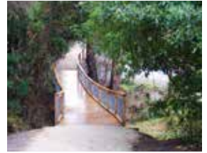
Shady Gully rainforest

J1) Shady Gully Walk: (0.6km) (Map1 E8 to C8) This walk passes through a dry sclerophyll forest of Mountain Grey Gum, Angophora and Stringy Bark and a remnant rainforest. Interpretive boards outline fauna and flora species of the area. A picnic table offers the opportunity for solitude.