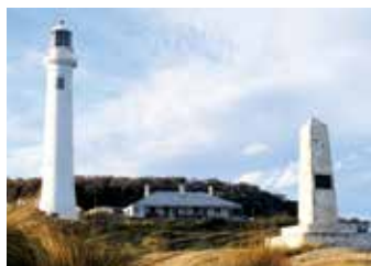
Point Hicks Lightstation & memorial

AN) Boyd's Tower and Davidson Whaling Station Historic Site: Access to these two historic sites is via Edrom Rd which turns off the Princes Hwy 43km north of Genoa. Apart from the historical aspects (well explained on information boards), the seascapes at the headland where Boyd's Tower is located are superb. On the southern side of the headland is a very interesting rock formation (an interpretive board explains the formation).