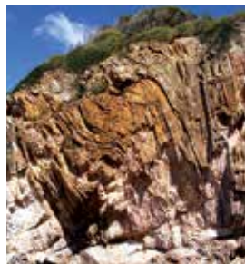
3 Beaches Walk

A walk to be enjoyed at low tide. From the mouth of the Betka River, turn right and follow the beach to a small rocky headland. Cross over the neck onto a second beach. Walk along this beach and enjoy the magnificent rock formations until you reach the end, where you once again cross over a small rocky headland onto the third beach where you will find stunning pink 'cathedral-like' cliffs. To return, retrace your steps.