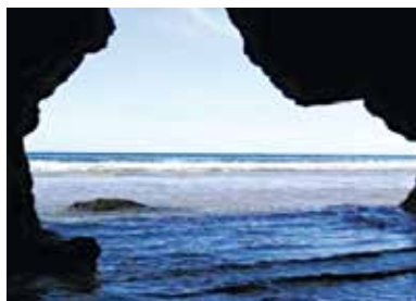
View from within cave

From Quarry Beach, return to the Old Coast Rd and turn left over the bridge. Proceed along this road to the parking area for Secret Beach. From here, there is a path and a set of steps down to Secret Beach, where good seascapes may be seen. There is a sea cave at the northern end of the beach, which you may be able to enter at low tide , watch your head as there is a rough rock overhead near the entrance.