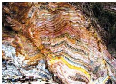
Rock strata Quarry Beach

Continue along Betka Rd past the airfield. (The road is gravel and often has potholes, take care). The road is now the Old Coast Rd. Just before a steel and concrete bridge, there is a signed turnoff to Quarry Beach. Pleasant seascapes are evident from the parking area, but the real feature is to be found about 70m to the left along the beach where an excellent example of folded and faulted colourful rock strata may be seen. (refer geology page 4-5)