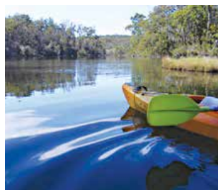
Canoeing Sou'West Arm

Return to the Genoa Road, turn right and travel approximately 2km to Sou' West Arm Track. Follow this track to the Sou' West Arm picnic ground (Map 2 B5); the jetty is a short walk from the parking bay and an extension of the track gives access to another scenic point. Return to the Genoa Road, turn right and travel approximately 3km to the Genoa Fire Trail. This 4WD track leads to a short path to a picnic ground and jetty on the Genoa River (Map 2 B4). Return to the Genoa Road, turn right and travel to the Gypsy Point Road. Proceed to Gypsy Point (Map 2 A2). Also investigate the Genoa River from the end of View Street.