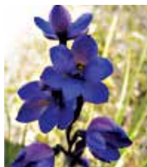
Dotted Sun Orchid

T2) Shipwreck Creek to Seal Creek Walk: (Approximately 6km return) The track has recently been upgraded. It is accessed from the south western side of Shipwreck Creek Beach. The track leads to the secluded Seal Creek Beach where there are impressive rock pools to explore. Approximately three quarters of the way along a sign indicates a path parallel to the creek down to the beach. Return by the same route.