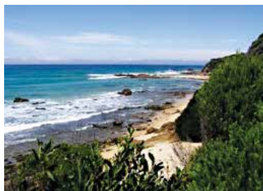
Bastion Point Lookouts

Proceed along Maurice Ave. to the roundabout and then along Betka Rd to Bastion Point Rd. Turn left and travel to the three lookouts providing excellent views of the entrance, Bastion Point, Gabo Island, Big Beach, Tullaberga Island and the Howe Range. You may access the supervised swimming beach (Summer School Holidays) from the first lookout, the second and third provide access to Bastion Point rock pools. Around the point is a stretch of beach which extends to Betka Beach. (This is part of the Town Beach Walk see page 9)