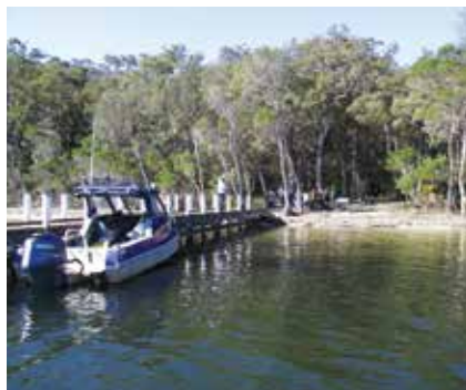
Cemetery Bight Jetty

V2) Allan Head to Cemetery Bight: (2km one way) (Map 2 H5 to I4) The track from Allan Head Picnic area follows the shore line before rising to an old bush cemetery where some early pioneers of the district are buried. Only one grave is now marked, the rest having been obscured by fire and time. It is a short walk down to the beach at Cemetery Bight.